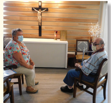
A resident visits the Chaplain

From the bottom of our hearts, we want to thank you for being an integral part of Penacook Place.